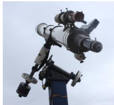
Draper-Hoynos 8" Refractor