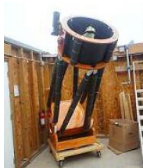
Titan- 25" Dobsonian Telescope